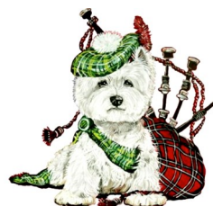
West Highland White Terrier